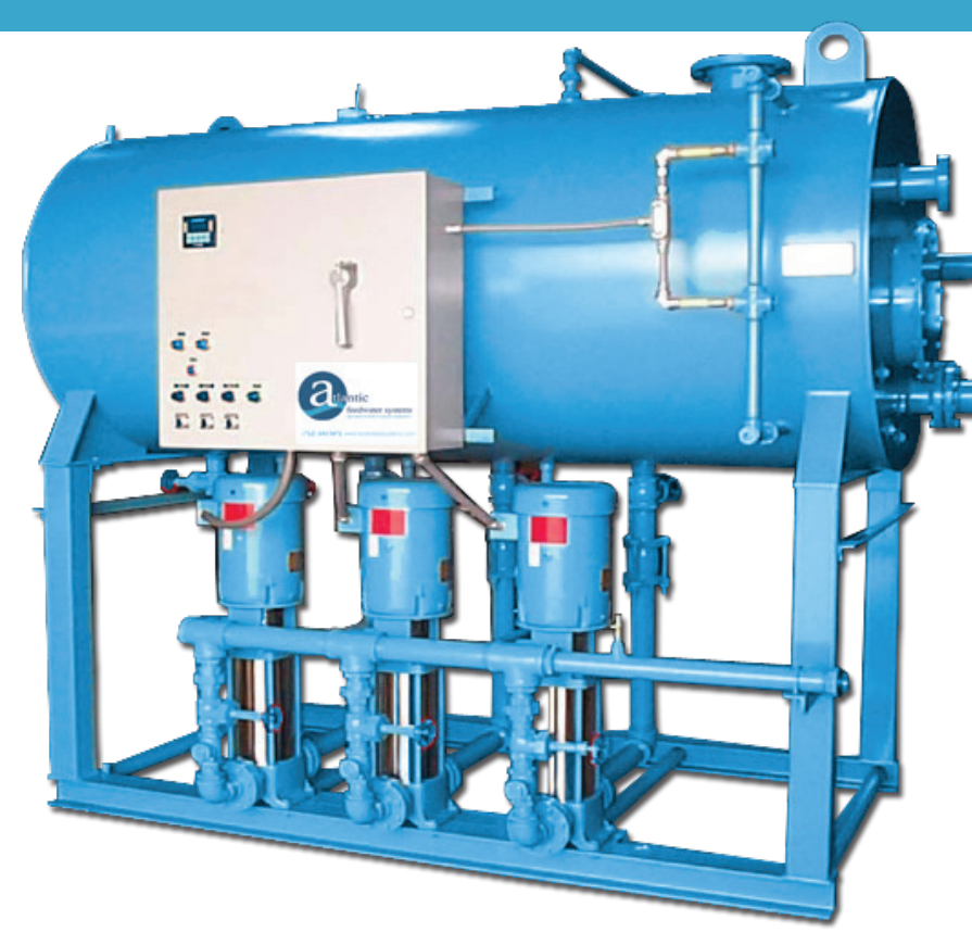
The A3, single-stage atmospheric deaerating heater offers uniform heating, while removing up to 99% of the oxygen in the make-up water.