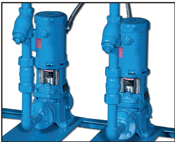
Close up of two boiler feed pumps installed on the 100 FS Compact Boiler Feedwater System